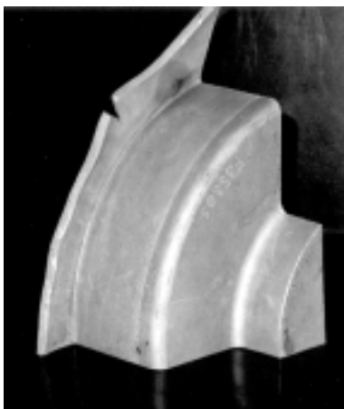
Figure 1: Hot forged Al MMC brake disc Slika 1: Zavorni disk iz Al MMC po utopnem kovanju

The machining trials performed demonstrated that Al MMC brake discs are routinely machinable using conventional machining centers and PCD cutting tools, Figure 3 .